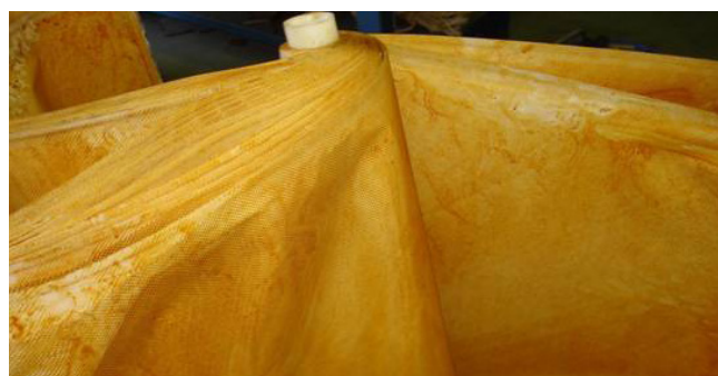
Removes Iron Deposits